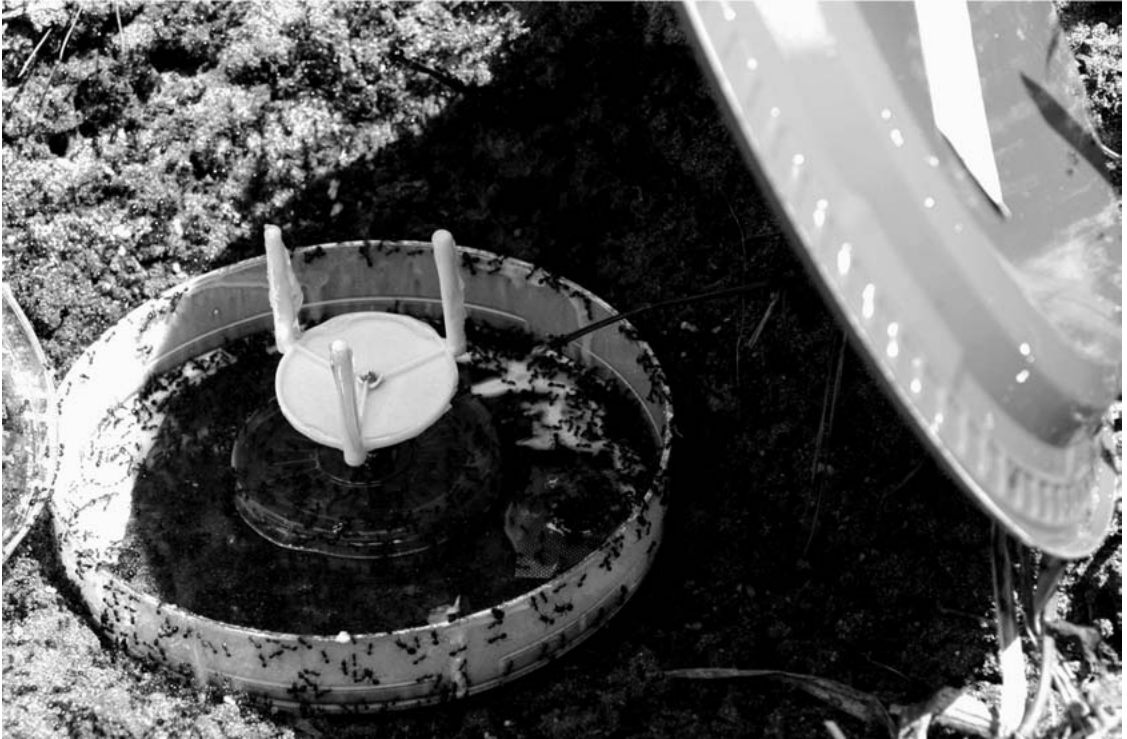
Fig. 1. The fly trap used in this survey was based on traps developed by Puckett et al. (2007) and LeBrun et al. (2008). It consisted of a white tri-stand top coated with Tanglefoot® attached to a slightly larger base by a bolt. The trap was placed inside a large fluon coated Petri dish filled with ants that swarmed into it after being placed into a disturbed mound. Flies were attracted to the disturbed ants and trapped when they landed to rest on the sticky tri-stand.

The trap was placed in the bottom half of a Petri dish (25 by 150 mm). The inside edges of this dish were coated with Fluon® and the Petri dish was settled into a disturbed fire ant mound so it acted like a pitfall trap rapidly collecting 1-10 gm of agitated ants as they swarmed out in defense of their mound. Once trapped in the Petri dish, the ants could no longer retreat into the mound. The ants usually remained in the Petri dish for 2-8 h