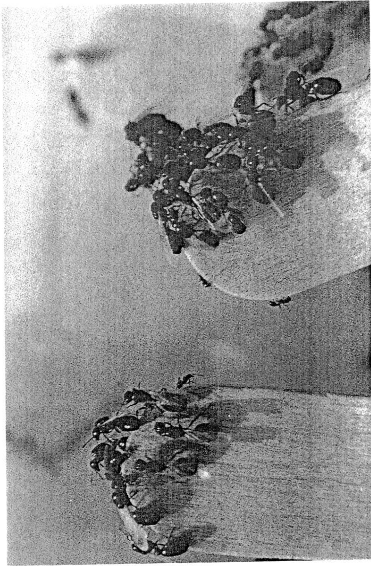
Figure 4. Close-up view of female alates on applicator sticks prior to flight.