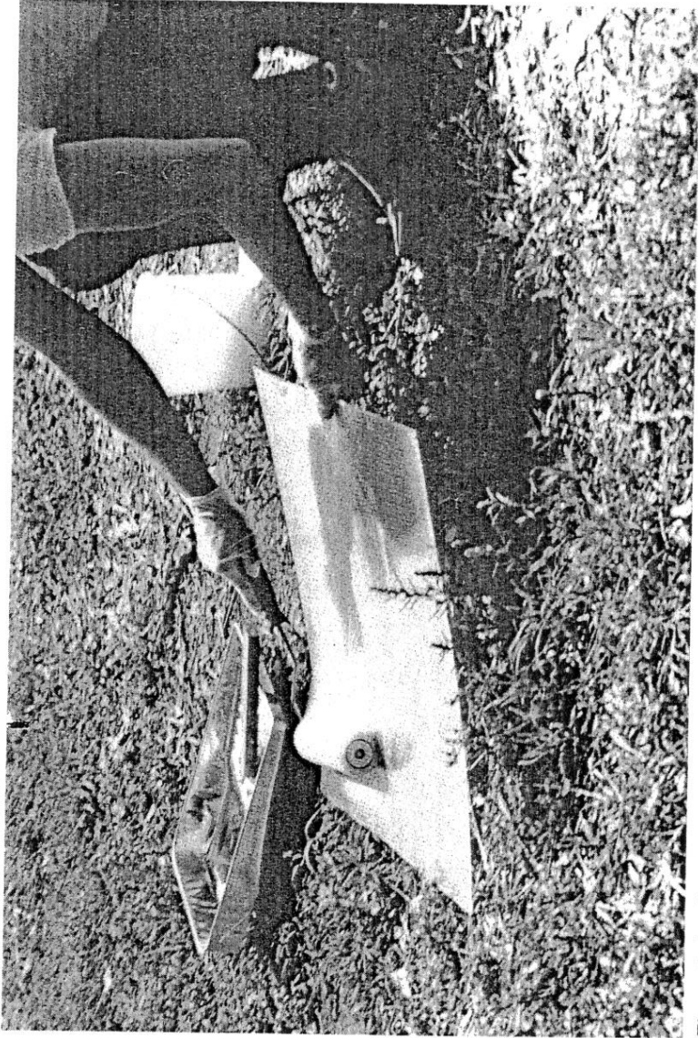
Figure 1. Application of Tack-trap-hexane solution to plexiglass trap.