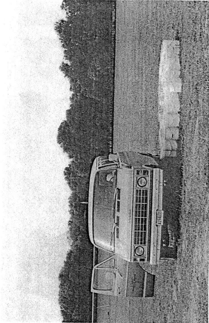
Figure 2. Buckets containing ant colonies in field test. Applicator sticks have been placed in the soil and vehicle has been placed up wind from buckets to shield them from the wind.