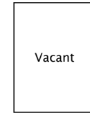
Vacant Director, Office of Outreach, Diversity, and Equal Opportunity