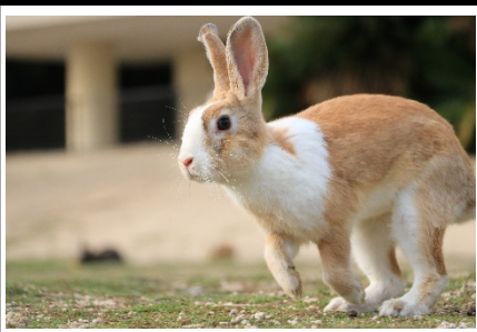
Animal: Rabbits Behavior: Hopping

Rabbits move and relocate by hopping. To hop, rabbits push off of the ground with their back legs and jump forward, landing on their front feet first, then back feet.