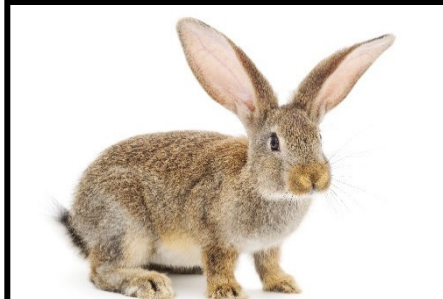
Animal: Rabbits Behavior: Thumping

Rabbits move and relocate by hopping. To hop, rabbits push off of the ground with their back legs and jump forward, landing on their front feet first, then back feet.