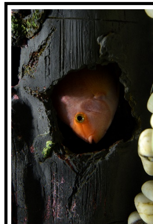
Animal: Fish Behavior: Hiding

Fish are schooling when the fish swim in the same direction, at the same speed, and turn together. Schooling may also be used to find food or keep predators away.