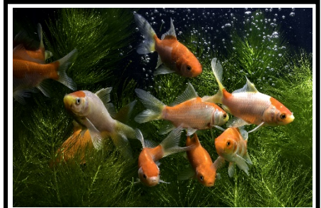
Animal: Fish Behavior: Shoaling

When fish sleep, they tend to spend their time at the bottom of their tank and appear in a still, dream-like state. Fish sleep for 8 to 12 hours per day.