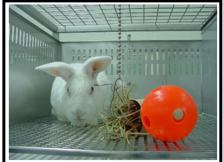
Animal: Rabbits Behavior: Chinning

Rabbits 'thump' when they sense danger or are mad or frightened. To thump, they stomp their back foot on the ground repetitively to make a loud noise.