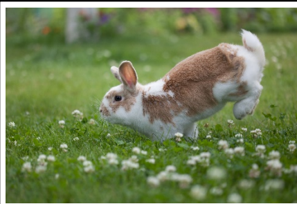
Animal: Rabbits Behavior: Binkying

Rabbits perform chinning by rubbing their chin on objects like toys to mark their territory and let other rabbits know that object belongs to them.