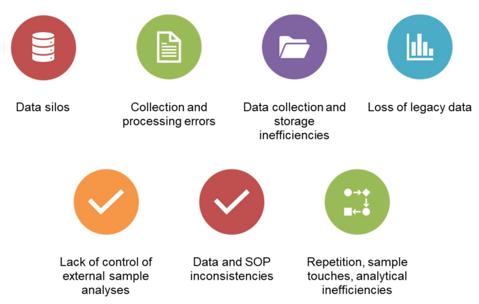
Figure 2. Data-based challenges facing researchers in agronomic sciences.

Figure 1. The USDA partnerships for data innovations (PDI), focused on standardizing, integrating, and automating agricultural research data through innovation.