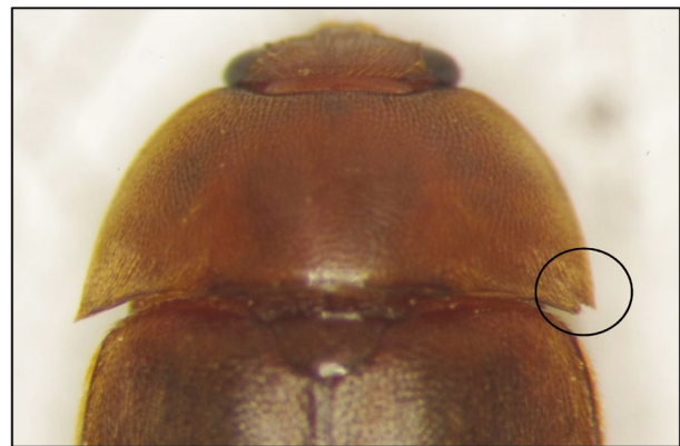
Fig. 2. A notch on the right side of the thorax of a male small hive beetle.

To study the invasive success of SHBs, a mark-release-recapture technique was used. We tracked individual beetles using thoracic notching (de Guzman et al. , 2012). Laboratory-reared beetles were used. Beetles were examined individually under a dissecting microscope to determine sex. Females have long ovipositors that extend straight from the tip of the abdomen while the males' genitalia protrude at a right angle from the ventral surface with the 8 th tergite easily viewed dorsally (Fig. 1). Female beetles were notched on the left side of the thorax while males were notched on the right side (Fig. 2). All beetles were starved for one day before use. Two cohorts of beetles consisting of 500 females and 500 males each were released on June 29 and July 6, 2011. The beetles were released at sunset because beetles are active during dusk. During each release, 10 containers with 50 females and 50 males each were placed around the apiary. One day after each release, colonies were inspected to retrieve released beetles. Because beetles normally hide in empty cells and small