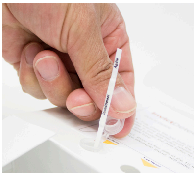
Insert InvictDetect ImmunoStrip for 10 minutes