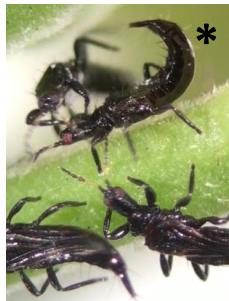
* Defense posture

Larvae and adults feed in groups on flushing leaves and stem tips. Larvae are bright orange and adults are black with wings folded over their bodies. When threatened, larvae and adults will curl their abdomens. Pupae hide in leaf litter on the ground.