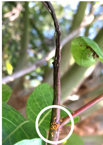
Thrips larvae feeding (circled area) on live portion of stem