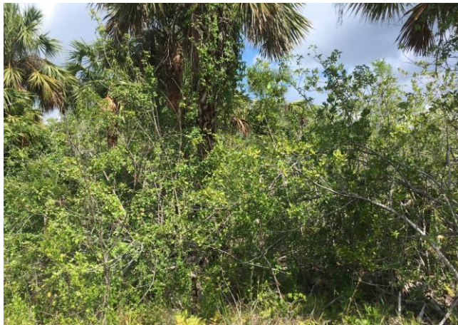
Natural habitat overwhelmed by Brazilian peppertree

Highly invasive in both natural habitats and urban landscapes