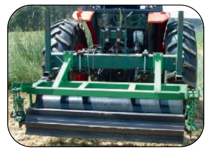
Two-stage roller/crimper (Kornecki, 2011, U.S. Patent #7,987,917 B1)

(Kornecki et al., 2009, U.S. Patent #7,604,067 B1)