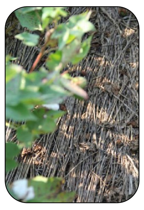
Thick cover prevents weed emergence and growth.

Row-spacing and plant population can be altered easily in some cropping systems. High plant populations and narrow row spacing promote quick canopy closure to decrease light reaching the ground, which helps inhibit weed germination. Starter fertilizers can also give crops a head start to increase their competitiveness against pests.