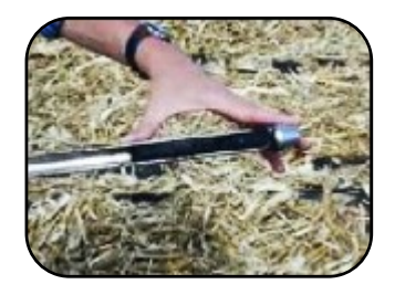
Adopting conservation systems helps build organic matter, increase biological activity, improve soil structure, and preserve soil moisture.

Soil structure or soil tilth will improve with a conservation system. Increased organic matter and biological activity improves soil aggregation, resulting in increased soil porosity and reduced bulk density. Residues on the soil surface also help reduce soil crusting by protecting the soil surface. Cover crop roots reduce compaction and loosen hard pans by creating root channels that subsequent cash crop roots can follow.