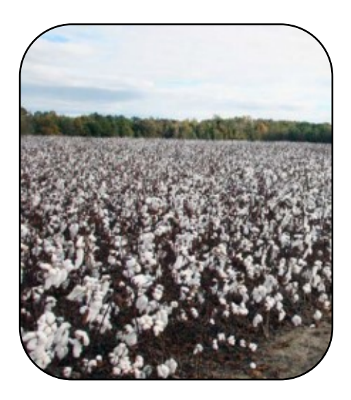
Adopting a conservation system can have a positive impact on profitability either from increasing yields and/or decreasing yield variability.

to grow a cover crop for seed production, utilize the cover crop as part of a grazing system, and other viable options to increase economic return.