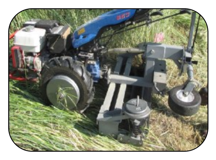
Two-stage roller/crimper for walk-behind tractors (Kornecki, 2011, U.S. Patent #7,987,917 B1)