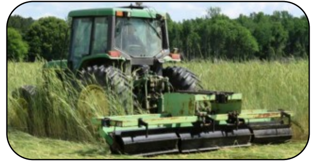
Straight crimping bar roller/crimper

In addition to the straight and curved crimping bar design, other roller designs have been developed at NSDL to facilitate cover crop rolling. These