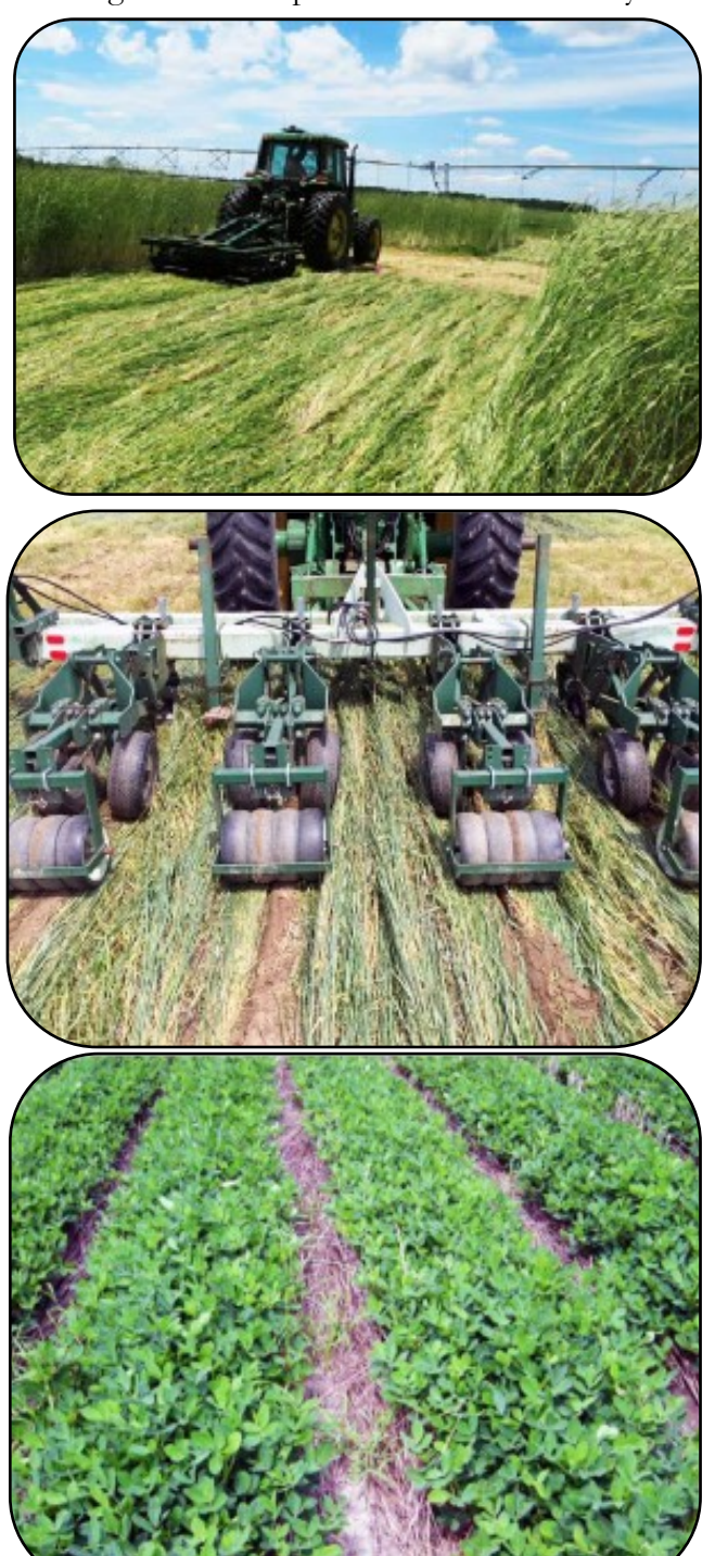
Conservation systems minimize surface soil disruption and protect the soil surface with a properly managed cover crop and plant residue throughout the year.

transition can be made to a conservation system. It is recommended that you begin planning for a transition several months in advance to help work out challenges, prior to implementation. This publication will help start the planning process by looking at several aspects of a conservation system.