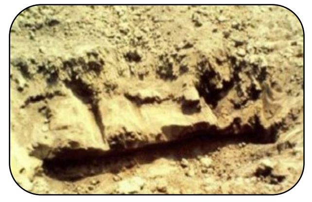
In-row subsoiling can loosen compacted layers with minimal surface soil disturbance.

Integrated management may prove to be the most effective tool against compaction. Using controlled trafficking patterns and cover crops can further diminish subsoiler requirements, reducing energy costs.