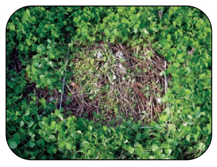
Accumulation of plant residue protects the soil surface. This picture includes the current crimson clover cover crop, cotton residue from last fall, cereal rye residue from last spring, and corn residue from over a year ago.

The Southeast has a long growing season with a wide range of climates. It is important to recognize how climate affects soil and residues. In warmer climates, soil activity is higher and crop residues break down faster than those in cooler climates. For example, in the Tennessee Valley region of Alabama (northern Alabama), some high-residue plots contain plant residues from two years prior. Rainfall variability may also affect the success of conservation systems. Proper management and timely planting of cover crops and cash crops, especially for dryland producers, is very important to the success of a conservation system.