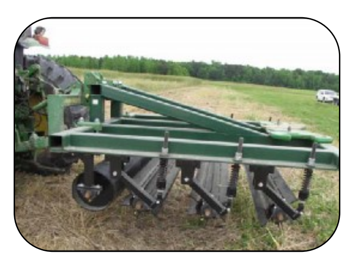
Four-stage roller/crimper (Kornecki, 2011, U.S. Patent #7,987,917 B1)