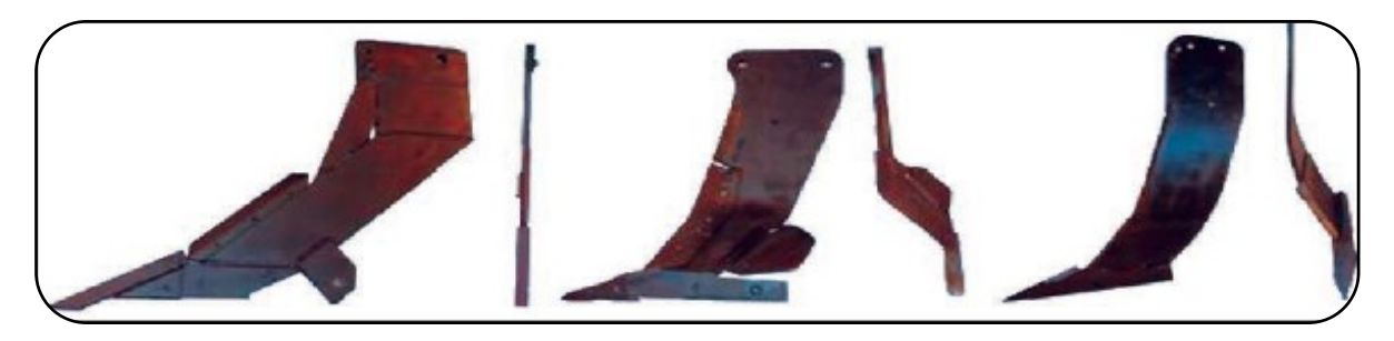
Side and front view of an in-row subsoiler (left) and two bent-leg subsoilders.

While conservation systems may reduce overall vehicle traffic in a field, wet soils that may be found under heavy residue are still susceptible to rutting and compaction. A controlled traffic system uses traffic lanes that become compacted enough to withstand heavy traffic without rutting, while leaving row middles free from wheel compaction. Precision guidance systems that are now widely available can be used to control trafficking patterns. Row information can be saved and used year after year to help locate traffic lanes.