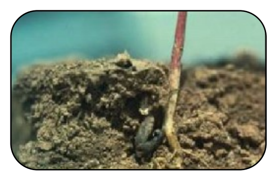
Shallow soil compaction resulting in soil resistance to a cotton seedling's root system.

Cover crops are an important tool for managing soil compaction. Many cover crops have aggressive rooting systems, which open channels for subsequent cash crop roots. Cereal rye, sorghum-sudangrass, and Brassica species (canola, turnip, and mustards) are known to be particularly effective at breaking through hard pans. Sunn hemp and lupins also have aggressive taproots that can penetrate hard pans. The presence of cover crops also enhances earthworm activity. Earthworm channels provide a path for roots to follow.