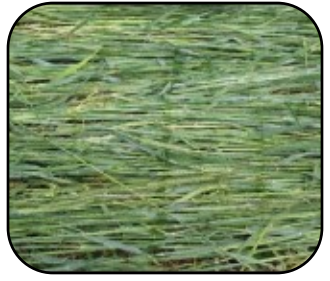
Cereal rye after crimping.

function of the bars is to crimp the cover crop stems against a firm soil surface without cutting them. When soil is too soft, crimping is ineffective. If cut (mowed), the cover crops can resprout, while loose residue may interfere with planting operations. When rolling is completed at the appropriate