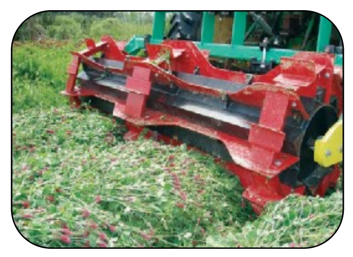
Rotary roller/crimper for elevated bed culture (Kornecki, 2009, U.S. Patent #7,562,517 B1)