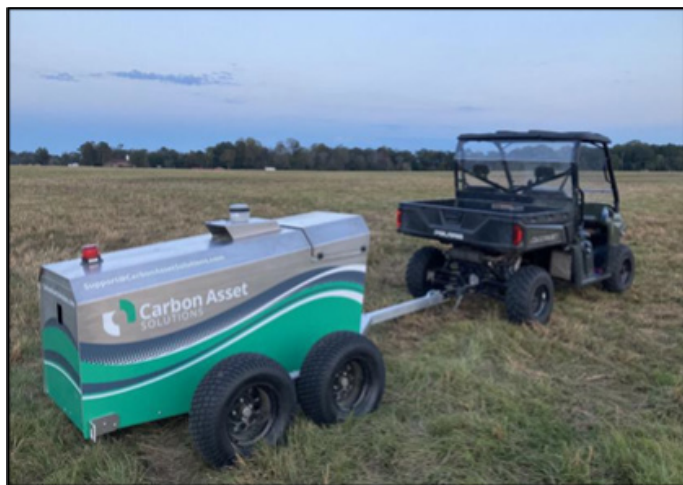
Fig. 4. General view of the MINS measurement system in the field.

This commercial method offers a powerful tool to unite the rigor of soil science with operational needs of modern precision agriculture. MINS has no effect on soil's chemical or biological components and different soil types will not impact results. MINS eliminates huge variability associated with point sampling and delivers large field measurements within 4 mg C/cm 3 that has been shown to be 80% more accurate compared to traditional core sampling.