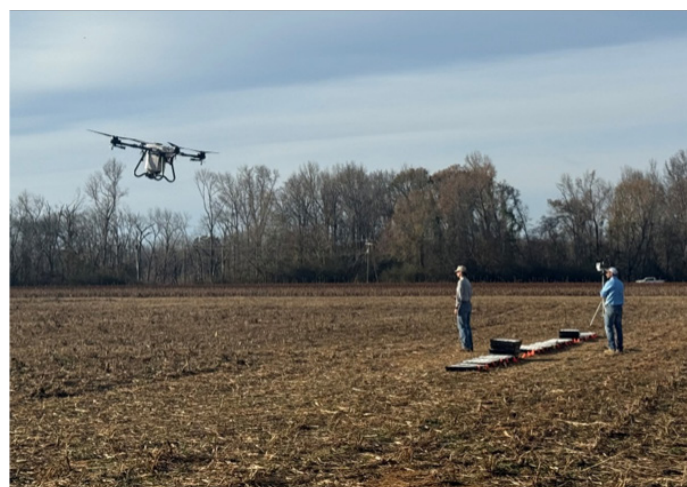
Fig. 1. The Hylio HYL-150 preparing to pass over the trays. Observers ensure the flight path crosses directly over the center-most collection pan.

This research can provide guidance to producers seeding cover crops with a drone equipped seed spreader, prior to harvest of their summer crop. This aerial seeding method reduces field and crop impacts of traditional equipment coupled with fuel savings to reduce inputs. Research-driven seed calibration methods ensure growers apply their desired seeding rate and provide potential