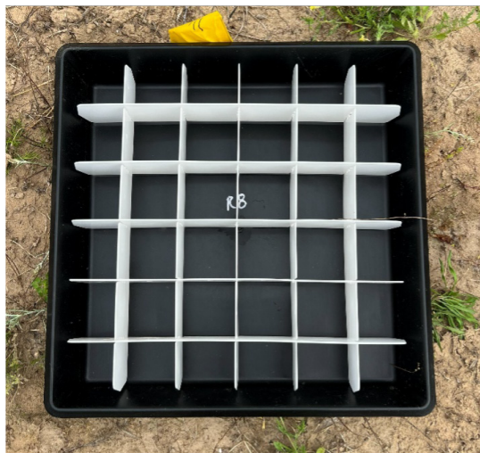
Fig. 2. Collection pans are setup in-line, spaced 2' on center, perpendicular to the drone's flight path. Tray dividers are used to reduce the cereal rye from bouncing out of the collection pan.

cost savings by reducing instances of over-application. Early establishment of cover crops fosters soil health benefits, such as building organic matter, supporting microbial activity and diversity, while preventing growth of cool season weeds. This spring we will continue de-