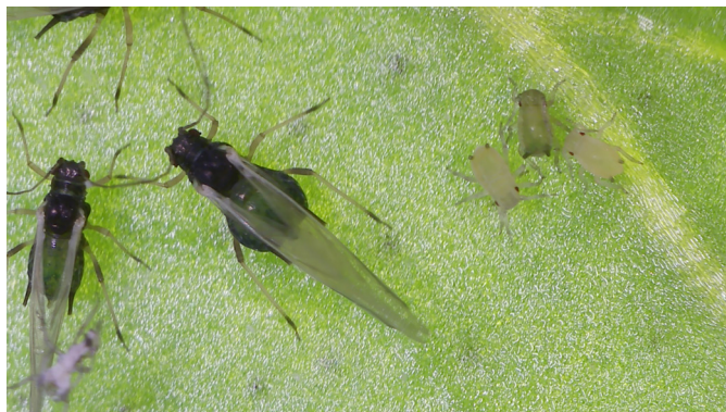
Fig. 5. Winged adult and nymph cotton aphids feeding on a cotton leaf.

This study also identified three novel iflaviruses. Complete genome sequences were determined for all three viruses, and two were shown to replicate in aphids, indicating active infection. Field surveys showed that these viruses occur at low prevalence, although their biological effects on aphids remain unknown.