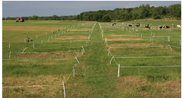
Pasture research plots at the U.S. Dairy Forage Research Center were used to study the effect of residue height and timing of grazing with four different grasses grazed under five different management systems.

A quick look at grass physiology helps to explain why. In order to regrow and make the necessary leaves, the