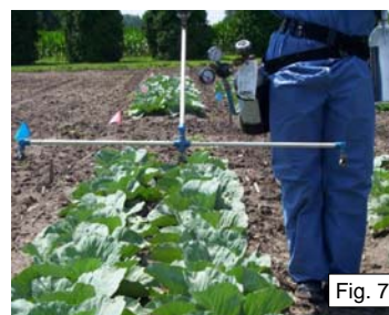
Fig. 7 CO 2 application of Goal on cabbage for annual weeds.

The Food-Use Program tests for pesticide residues for human safety.