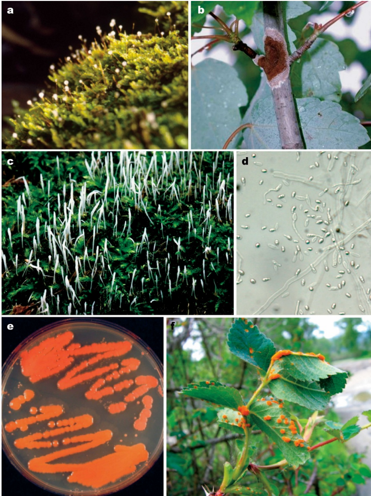
FIG. 1. Representatives of the Pucciniomycotina. a. Jola cf. javensis (Platyglloeales) fruiting on Sematophyllum swartzii . b. Septobasidium burtii (Septobasidiales) fungal mat completely covering scale insects. c. Eocronartium muscicola (Platyglloeales) fruiting on undetermined moss. d. Yeast and filamentous cells of Sporidiobolus pararoseus (Sporidiobolales). e. Cultures of two Sporidiobolus species in the S. pararoseus clade (Sporidiobolales). f. Phragmidium sp. (Pucciniales) on Rosa rubiginosa .