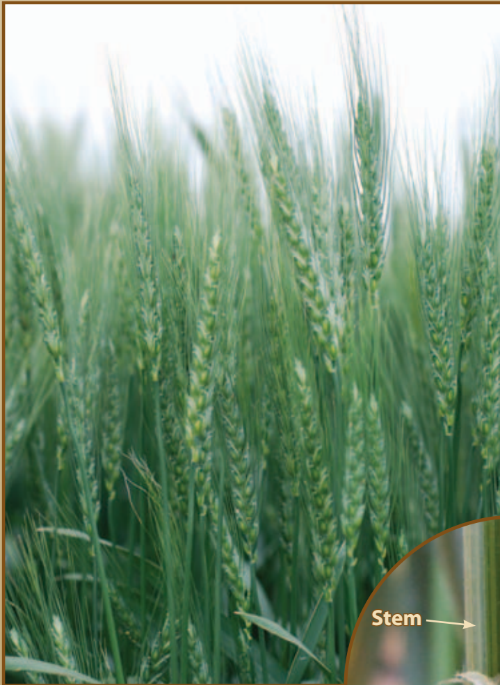
Figure 1. The diagnosis of rust diseases requires some basic understanding of plant anatomy and a quick review of this information may improve the accuracy of the identification process.

depends on host susceptibility and weather conditions, but the loss also is influenced by the timing and severity of disease outbreaks relative to crop growth stage. The greatest yield losses occur when one or more of these diseases occur before the heading stage of development. Early detection and proper identification are critical to in-season disease management and future variety selection.