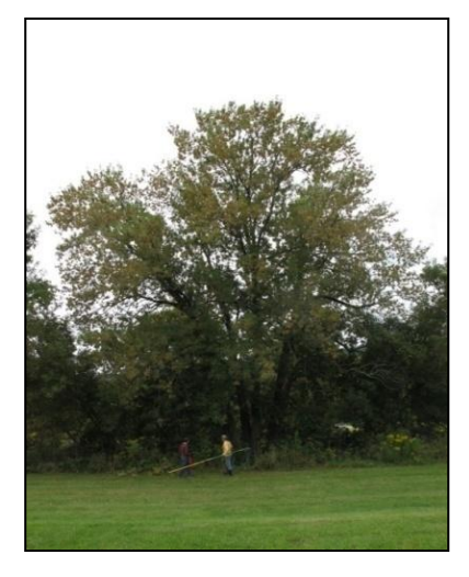
F. pennsylvania – A31090

Our next site that followed along the Tioga River was a F. pennsylvanica accession where a majority of the specimens sampled had very pubescent twigs and buds. In addition, one of the specimens was enormous with multiple trunks (pictured on the right).