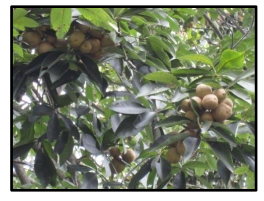
Aesculus flava - Ames 31048

noted a few more specimens very close to highway 417 adjacent to a urban wetland. Fruits were abundant and foliage quality was exceptional. It was slightly odd finding this species, but its context leads us to believe it is of native origin. Before daylight was gone, we were able to meet up with Michael Dosmann and harvest a F. pennsylvanica population just outside of Big Flatts, NY.