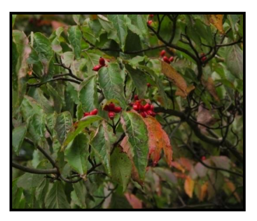
Cornus florida – Ames 31062

Our first site of Fraxinus americana (A31082) was accompanied by a collection of Carpinus caroliniana . Our second site of F. americana (A31081) also resulted in a collection of Betula lenta and Viburnum lentago . Our last site for the day near Cameron resulted in additional exploration to higher elevations resulting in a nice find of Cornus florida and Carya ovata . The fruit display on the C. florida was outstanding. Andy pointed out an interesting group of shrubby Quercus , and through taking a herbarium specimen, turned out to be Quercus ilicifolia . Due to the low quantity of acorns, it was decided not to include the sample as a NPGS collection.