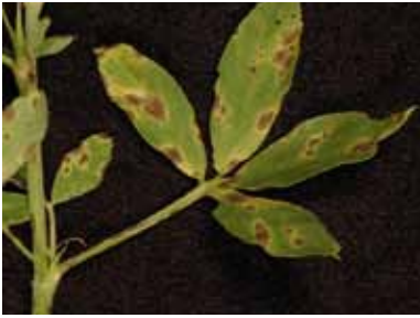
Table 2. Average % leaf loss of alfalfa at four maturity stages.