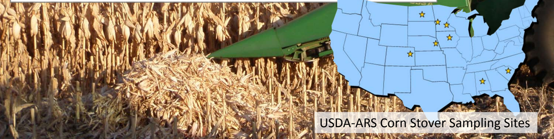
USDA-ARS Corn Stover Sampling Sites