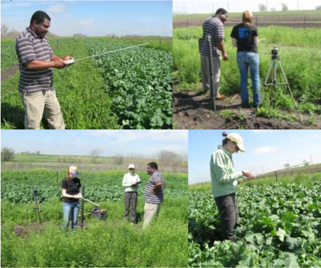
Figure 11: Calibrate.