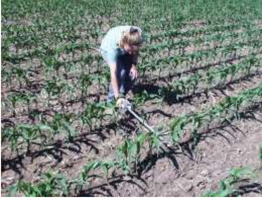
Figure 5: Sampling in row crops.