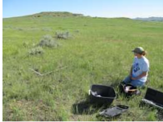
Figure 6: Sampling in natural environments.