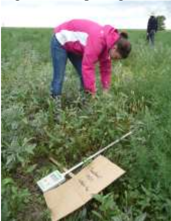
Figure 8: Preparing a natural sample area.