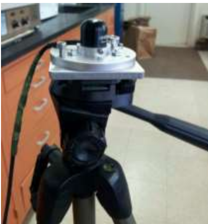
Figure 3: External sensor and leveling plate on the tripod.