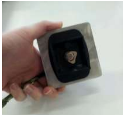
Figure 2: Bottom view of mounting plate with tripod attachment.