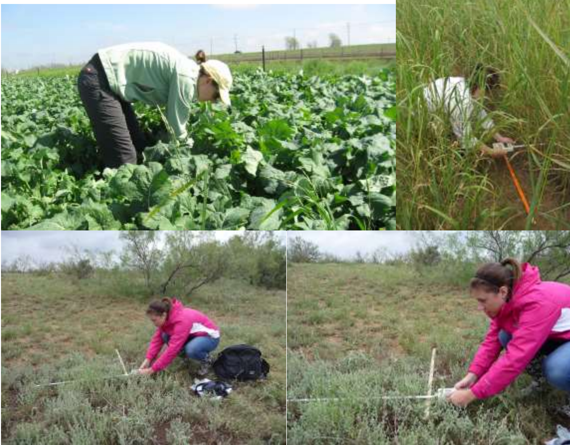
Figure 12: Take light readings.