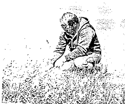
Fig. 1 Scoring grasses for morphological development requires field visits.

use of common scales for scoring development. Following is a brief description of selected scales that can be used to determine the development stage of perennial grasses. For details on each scale, the original reference citation should be reviewed.