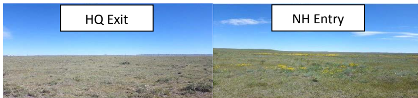
Above: Represents Headquarters VOR at exit and Nighthawk VOR upon entry.