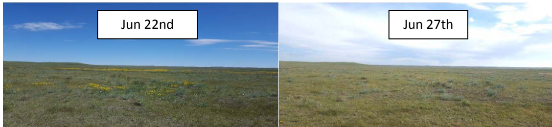
Above: Compares a week's worth of grazing in Nighthawk. The steers have really grazed down the Stiff Greenthread (yellow flower in left photo).

Desktop Field View: from our office to yours.