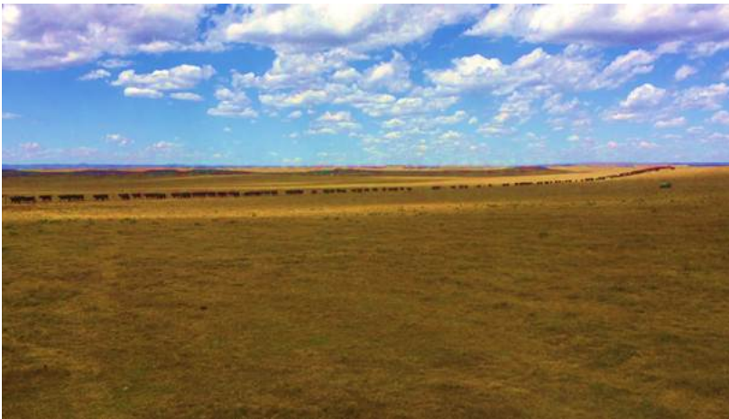
Above: The steers line up while moving to Hill Tank on Friday.

On behalf of the USDA-ARS-Rangeland Resources Research Unit, I thank you all for your continued participation in this project.