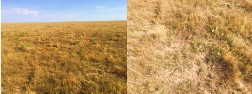
Above: A landscape and close-up view of Hill Tank from Monday.