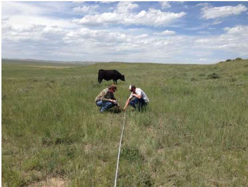
Our Crow Valley compadres identifying vegetation with the help of a TGM steer