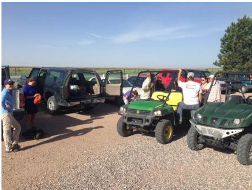
Plan of Attack: The Cheyenne and Fort Collins veg crews getting ready for the day