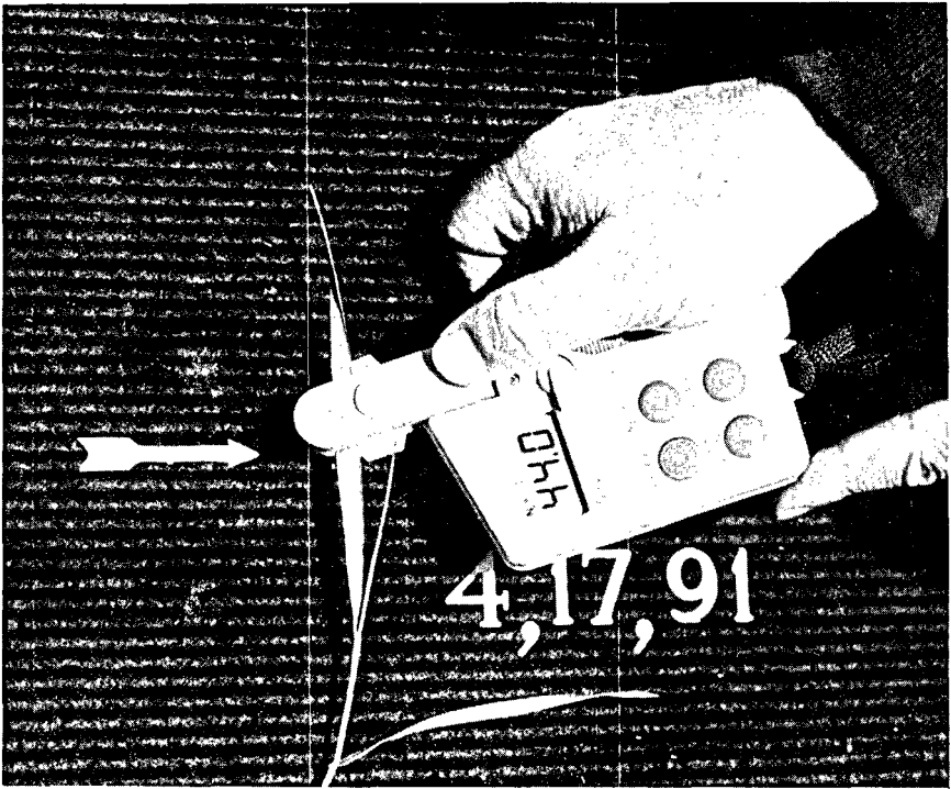
FIGURE 1. Placement of the SPAD 502 Chlorophyll Meter at the Mid-Length on the Uppermost Fully Expanded Leaf at Feekes 5 Growth Stage.

Saddle Brook, NJ) 3 (Marshall and Whitehead, 1985). Soil samples for NH 4 -N and NO 3 -N analysis were taken from each plot at the same time leaf samples were removed for meter readings and leaf N analysis. Soil samples were air-dried, ground to pass a 2-mm screen, extracted with 1 mol/L KCl, and analyzed for available NO 3 -N and NH 4 -N by a Technicon Autoanalyzer (Technicon, Tarryton, NY) 3 .