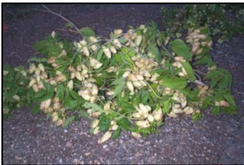
CHUM 1352 Humulus lupulus var. neomexicanus from the White River watershed near Buford, Colorado. Cones and seeds were collected on September 13, 2002.

Scott Dorsch, Biologist, Busch Agricultural Resources, Inc., 3515 East County Road 52, Ft. Collins, Colorado, 80524