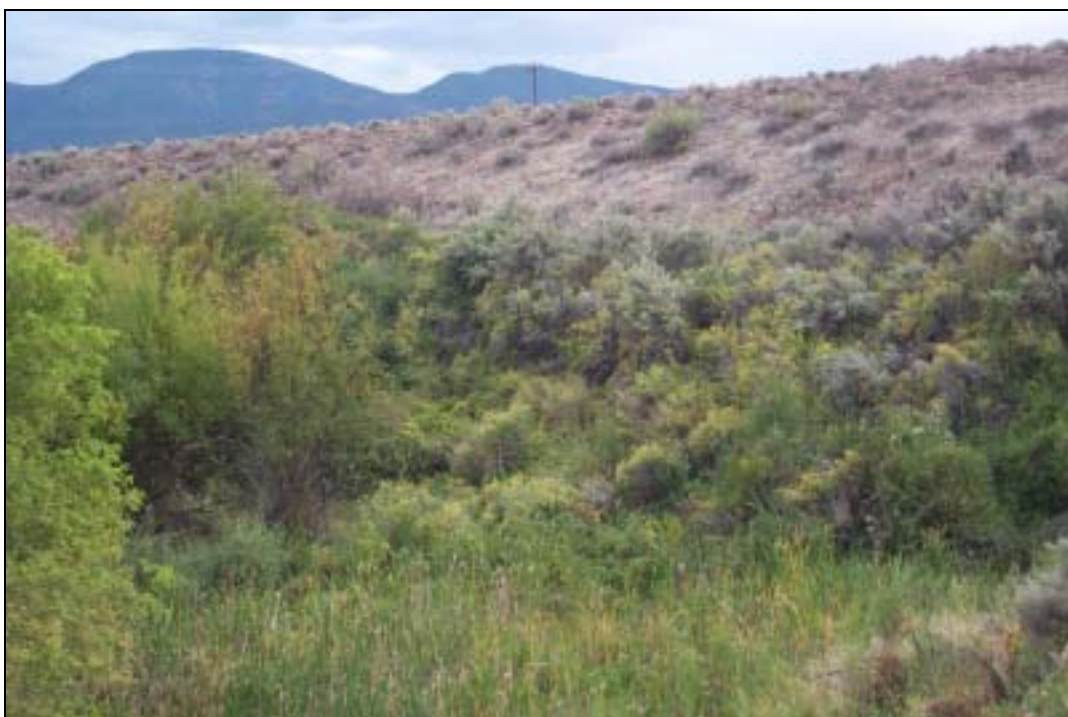
Habitat of CHUM 1349, Humulus lupulus var. neomexicanus from Beaver Creek in the Yampa/Green River Watershed, Colorado.