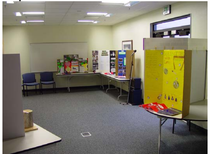
Poster presentations by Aberdeen Grade School and Aberdeen Middle School science fair winners.