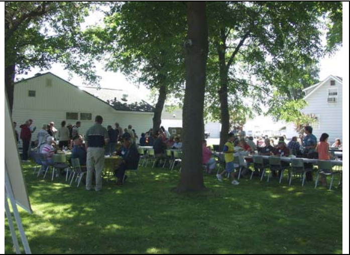
Visitors enjoying lunch on the campus of the Aberdeen Research and Extension Center after the dedication ceremony.