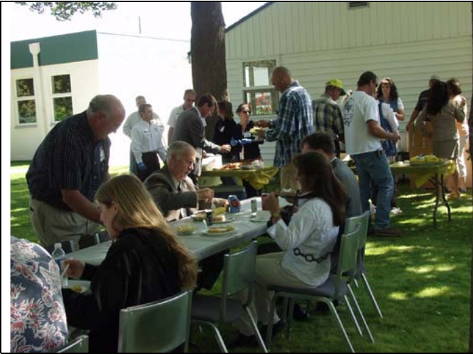
Visitors enjoying lunch on the campus of the Aberdeen Research and Extension Center after the dedication ceremony.