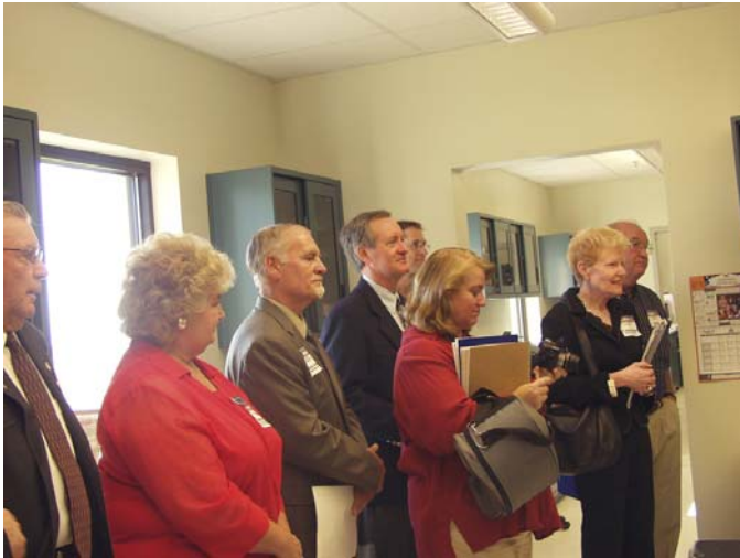
Senator Crapo and other visitors tour the new facility.

Dedication Tours, Science Fair & Lunch August 17, 2006