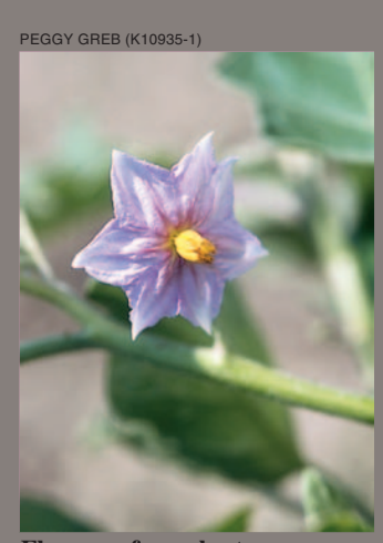
Flowers of eggplant are similar to those of potato and tomato. All three plants are solanaceous species.

Eggplant goes back about 2,000 years in the recorded history of India, and there are actually more than 30 Sanskrit names for the fruit in ancient Indian literature. Thomas Jefferson is credited with bringing the fruit to the United States.—By David Elstein , ARS.