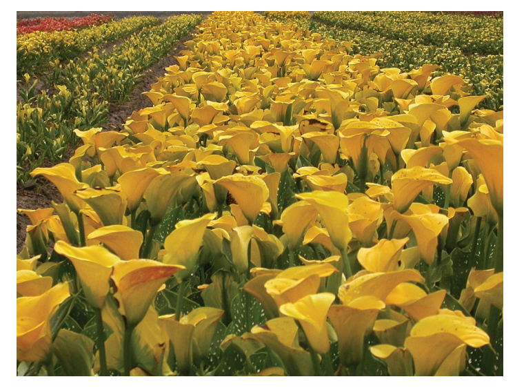
Figure 2. Yellow calla lilies being grown in soil fumigated with a mixture of 1, 3-dichloropropene and chloropicrin prior to planting near Moss Landing California.

two formulations of 1,3-dichloropropene plus Pic provided equal or better control of Meloidogyne spp. compared with the MeBr standard, but control of nutsedge was not as good as the standard. Also in Florida, researchers studied alternative treatments for strawberry production (Gilreath et al. 2008). 1,3-D plus chloropicrin and dazomet, 1,3-D plus Pic, Pic and metam sodium, and fosthiazate (an OP nematicide) and Pic proved to be as valuable as the grower-standard MeBr plus Pic on strawberry plant vigor, sting nematode control, and early and total marketable yields. In California, researchers found that an emulsifiable formulation of 1,3-D and Pic applied through irrigation water consistently resulted in yields of 95% to 110% relative to standard MeBr plus Pic treatment (Ajwa & Trout 2004).